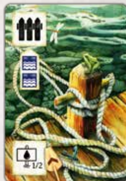
N03 Backhanded hitch

After playing this card, you may choose and perform one additional action from among the starting two options of the river board.